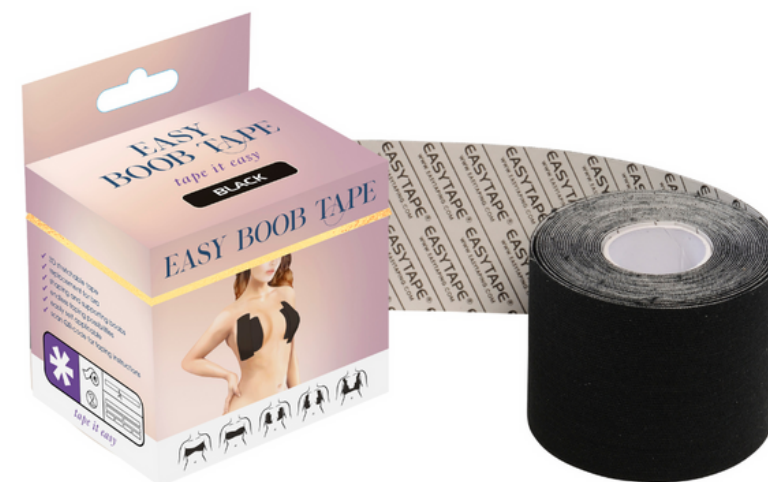
Easy Boob Tape - Black