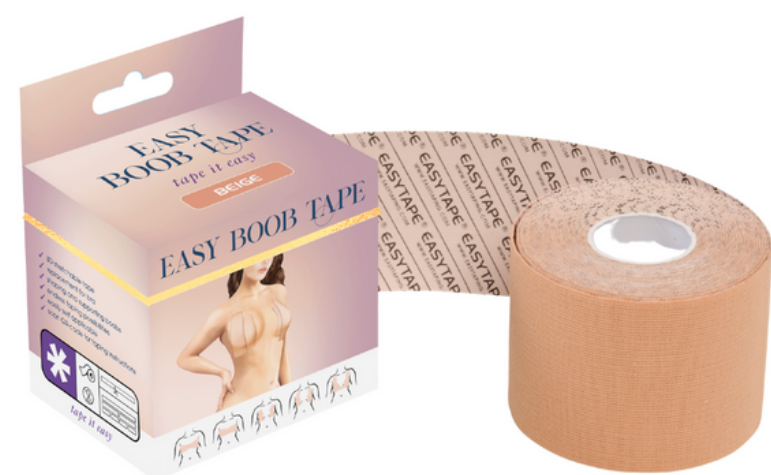
Easy BoobTape - Beige