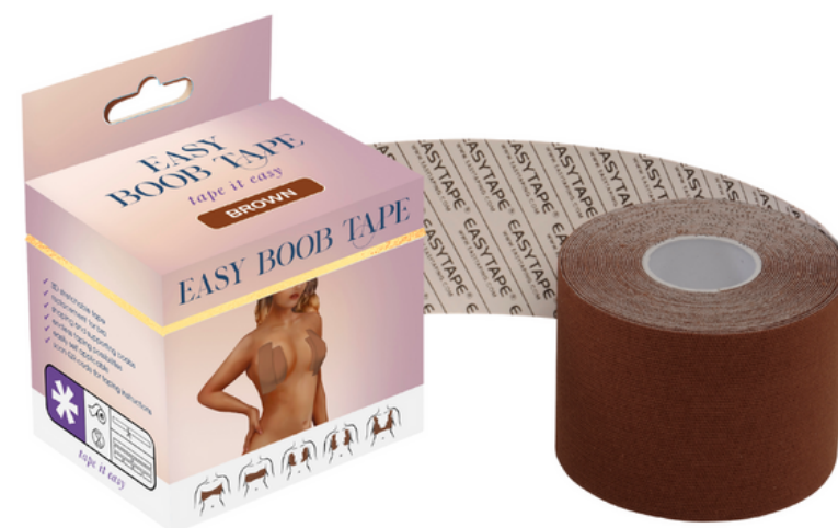
Easy Boob Tape - Brown