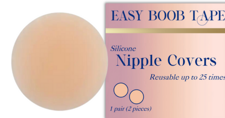
Silicone Nipple Covers